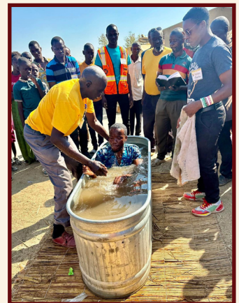
A stock tank became a mobile baptistry during the annual Zambia Medical Mission

Those who were baptized on the medical mission received Tonga-language Bibles. After the medical mission, Namwianga’s Evangelism and Spiritual Growth Team immediately began to contact and follow up with the new Christians. You are a part of this great work of the Lord through your support of Zambia Medical Mission, the Evangelism and Spiritual Growth Team, and the Bible ministry. THANK YOU!