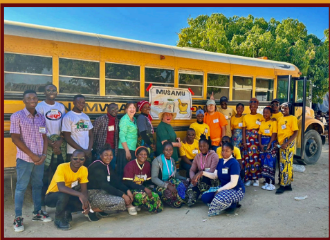
The Pills on Wheels pharmacy bus filled 23,000 prescriptions, thanks to your gifts.

THANK YOU for supporting the medical mission. You are saving lives and making a physical and spiritual difference for thousands of patients.