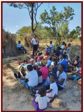
Ten new congregations started in 2023 as a result of bicycle evangelists, college graduates who are trained in evangelism, or other churches reaching out to neighboring villages.