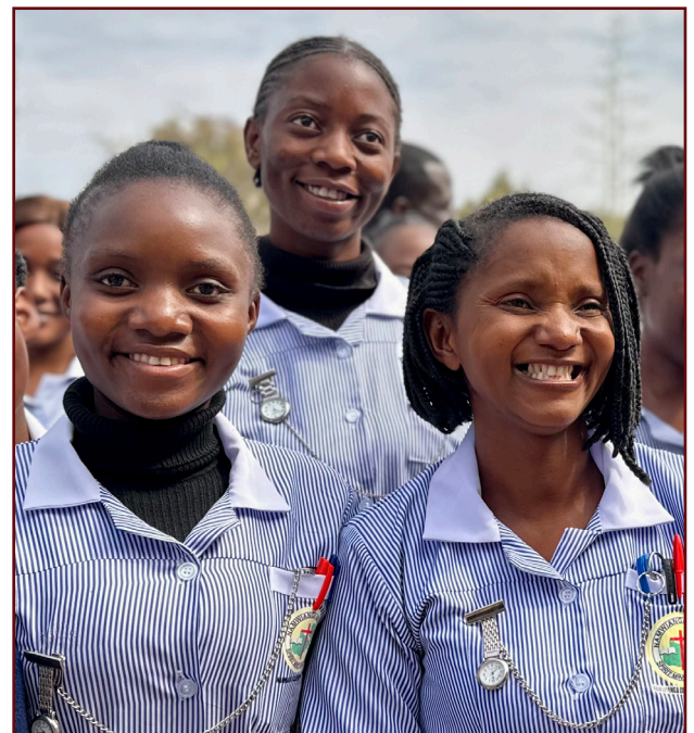
Your support can prepare a well-qualified, caring nurse to serve in Jesus' name (file photo)

Donate today by using the enclosed form or by giving online at zambiamission.org/nurses .